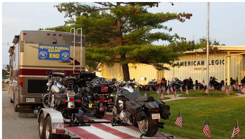
For more information about the MIA Project, go to their website at http://www.miap.us/

On Thursday, August 27, Post 202 was honored to host a BBQ dinner for participants of the Missing in America Project "Sea to Shining Sea" escort that was on it's way to Virginia from California. Their mission: to deliver the unclaimed remains of six American veterans for interment at Arlington National Cemetery II. The six veterans—one from each branch of service plus one Buffalo Soldier from WWI— will be laid to rest with a full military honors service on September 1.